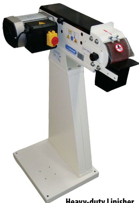
Heavy-duty Linisher Model: 1220/100/P1