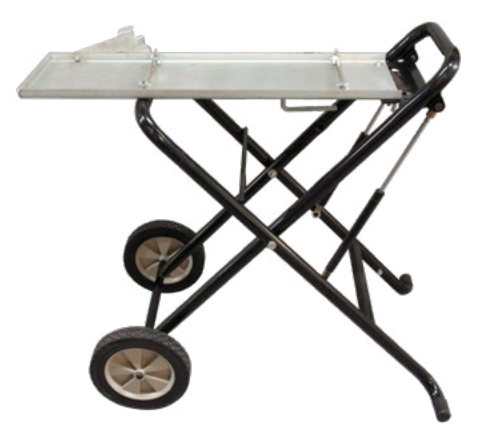
In raised position ready for use.