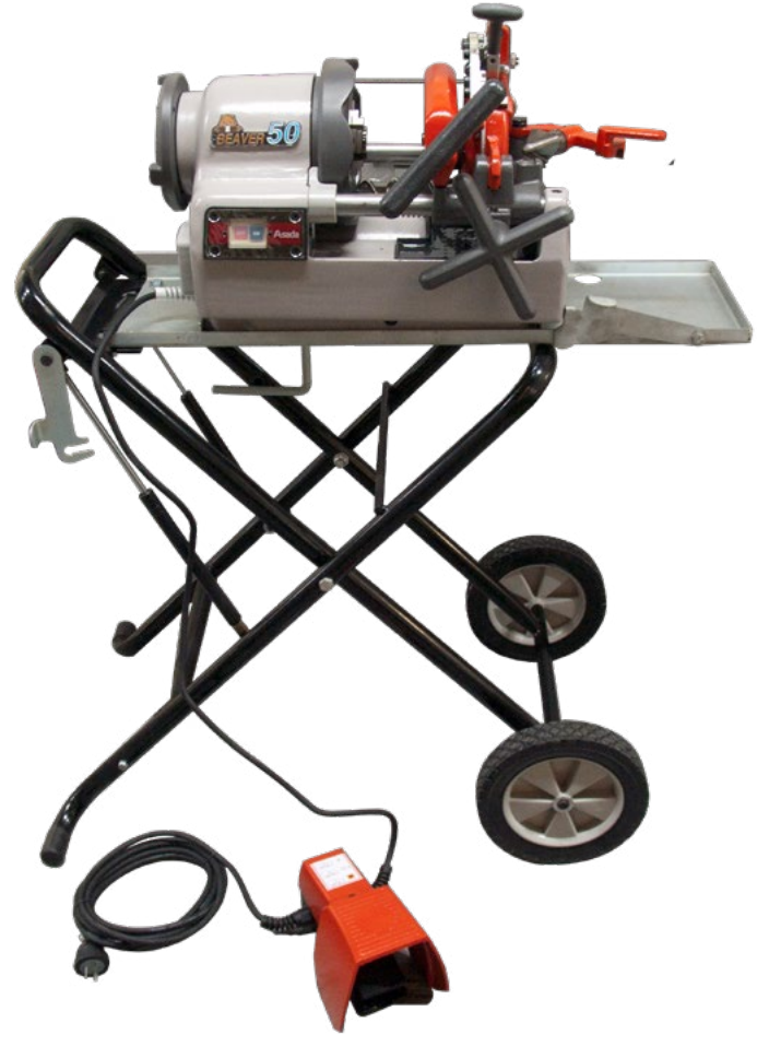
Pictured with Asada Beaver B50-AT and accessories (all sold separately)