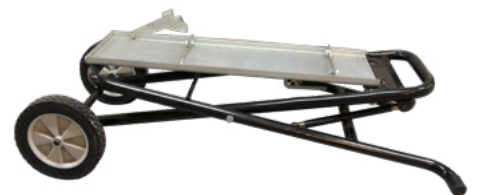
In collapsed position for storage or transportation.