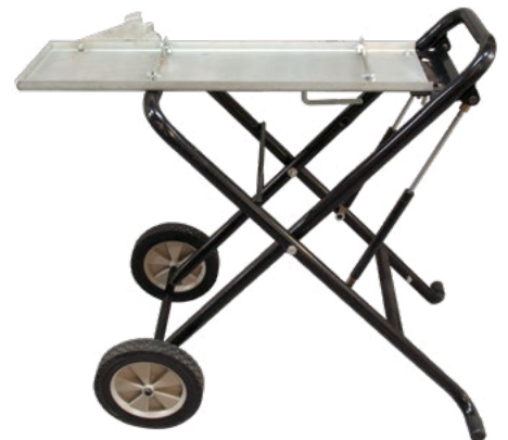
In raised position ready for use.