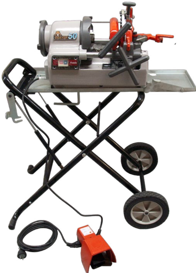
Pictured with Asada Beaver B50-AT and accessories (all sold separately)