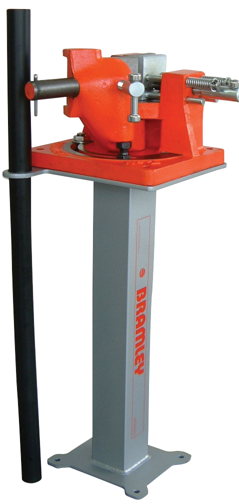
Model AB2 mounted onto optional stand Part No. ABSTAND