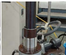
Re-installing the ram.