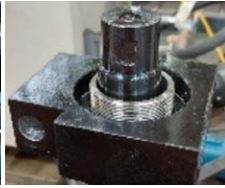
Outer nut removed from the cylinder.