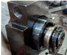
Inner nut on ram undone with ram guide exposed.