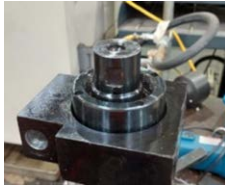
Outer nut retaining pivot block.

Care must be taken re-assembling the main ram into the cylinder as it is easy to damage the ram seal.