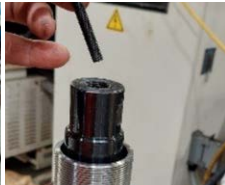
Undoing spring tension grub screw