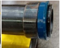
Ram seal for replacing.

(Note this pic has the outer nut and pivot mount block removed, this is not necessary for removing the ram.)