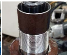
Re-install spring tension cap screw

A seal compression guide tool (similar to a piston ring compression installing tool) should be used when reinstalling the ram into the cylinder. This will compress the seal and allow it to move into the cylinder without damage.