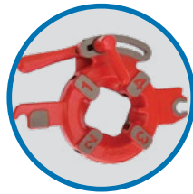
Manual Die Head for Pipe Machines