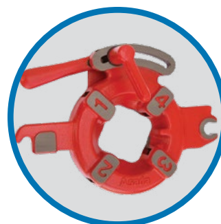
Manual Die Head for Pipe Machines